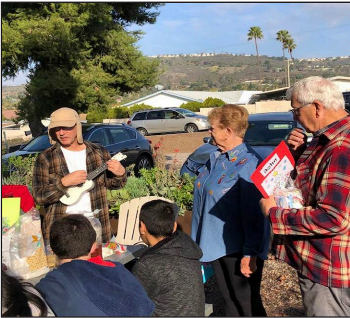
Event at Woodland Park Elementary.

Therapist who works with seniors in their home. There are credible references for musicians who offer private session, we suggest speaking to the Activities Director at your local nursing home, since they regularly book performers in the style of music seniors prefer.